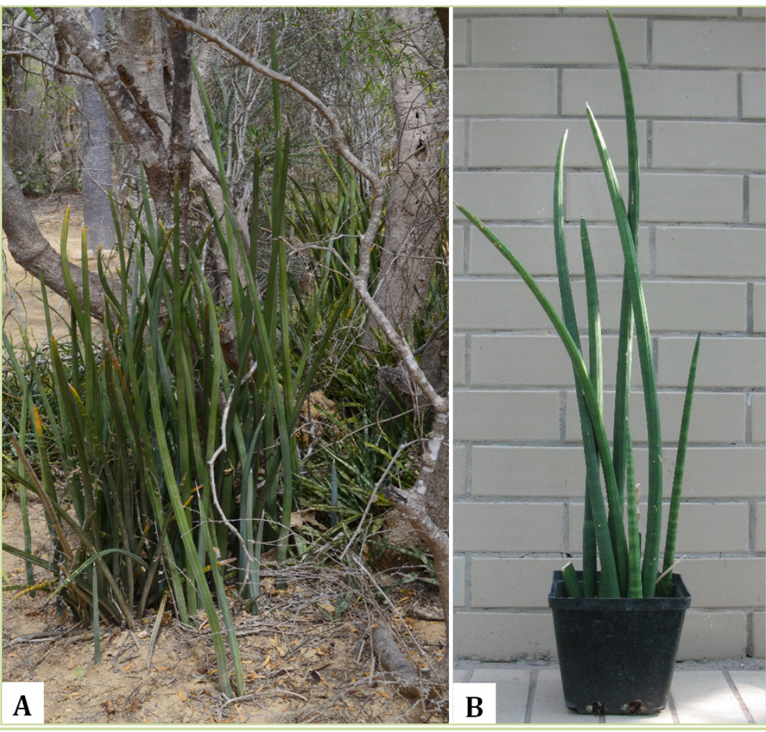
Figure 1Sansevieria cylindrica Bojer ex Hook: A – the growth habit of S. cylindrica in semi-natural<br/>habitat, Madagascar, Toliara, d'Antsokay Arboretum; B – a specimen<br/>of S. cylindrica cultivated under glasshouse conditions at NBG (Kyiv, Ukraine)